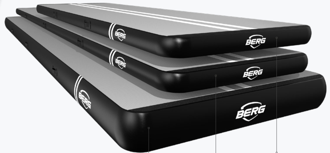
AirTracks Home 300.

All AirTracks come with a hand pump. So you can pump up your AirTrack and use it anywhere.